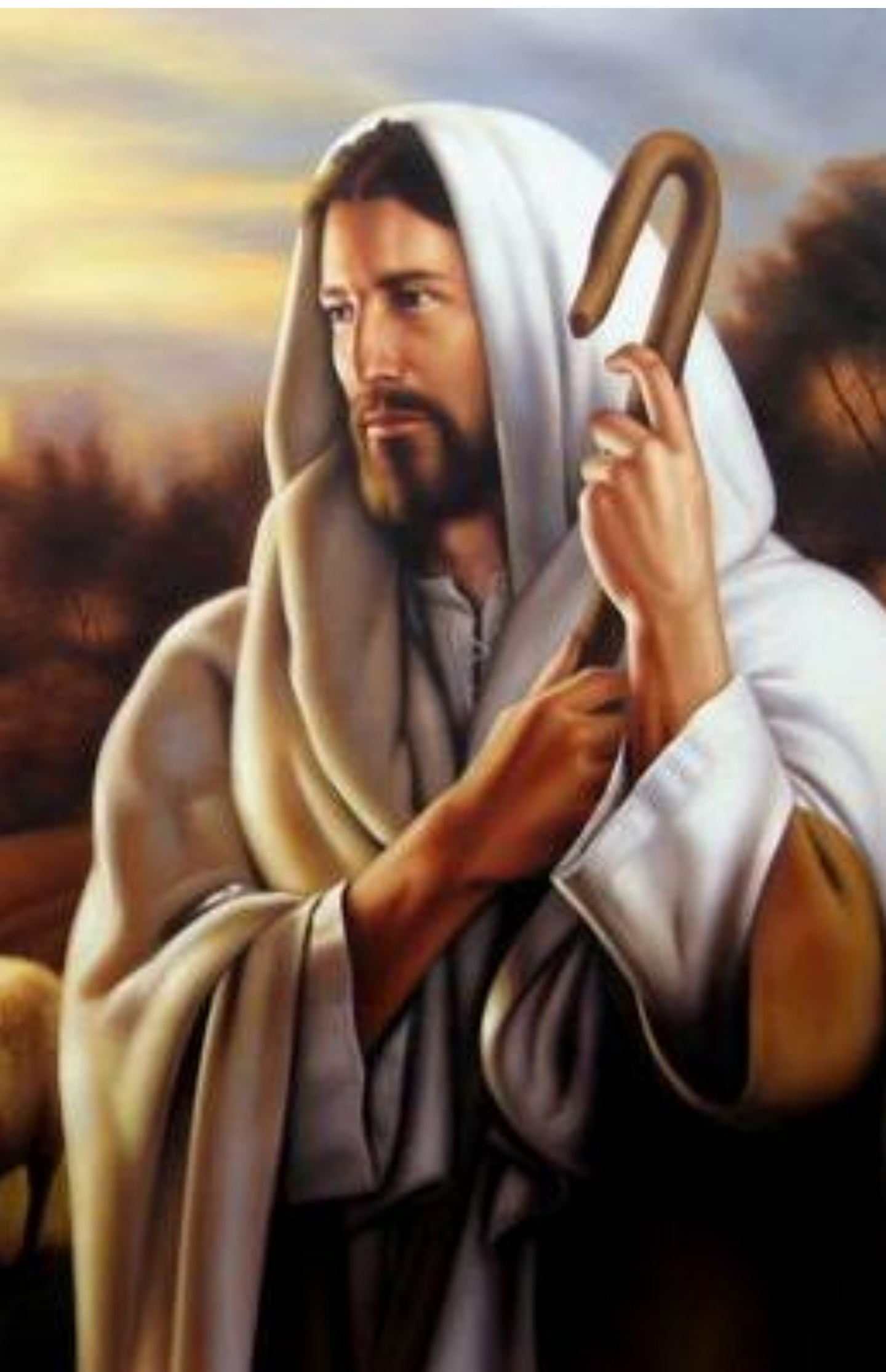
Day 8, Friday, 21 st May '21 Jesus Christ the Good Shepherd